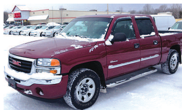
2006 GMC SIERRA 4WD, 4 door, bedliner, tow pkg. AS LOW AS $199 A MONTH