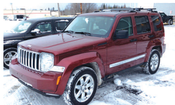
2008 JEEP LIBERTY LIMITED 4x4, leather, sunroof, tow pkg, nice AS LOW AS $199 A MONTH