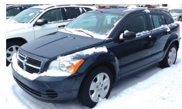
2007 DODGE CALIBER SXT 93 K. Great MPG AS LOW AS $199 A MONTH