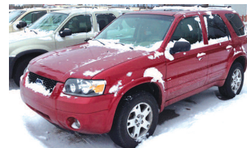
2005 FORD ESCAPE 4WD, leather, sunroof, tow pkg. AS LOW AS $199 A MONTH