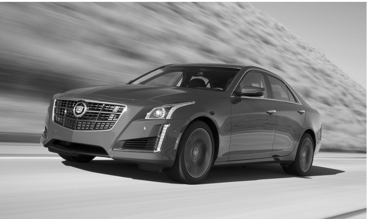
The rear-wheel-drive CTS Vsport is equipped with the all-new 420-hp 3.6-liter Cadillac Twin-Turbo V-6 engine and is the first Cadillac to receive the brand's eight-speed automatic.