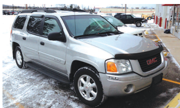
2005 GMC ENVOY XL 4WD, tow pkg, 3rd row seat, beautiful AS LOW AS $199 A MONTH